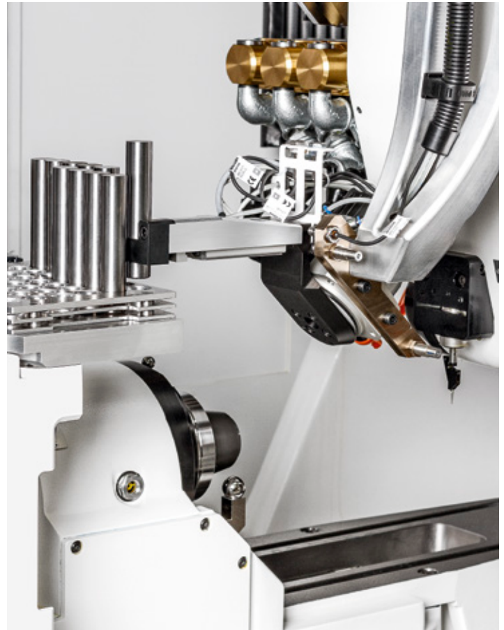
Option: Top loader

Walter Maschinenbau GmbH Jopestr. 5 · D-72072 Tübingen Tel. +49 7071 9393-0 · Fax +49 7071 9393-695 info@walter-machines.com